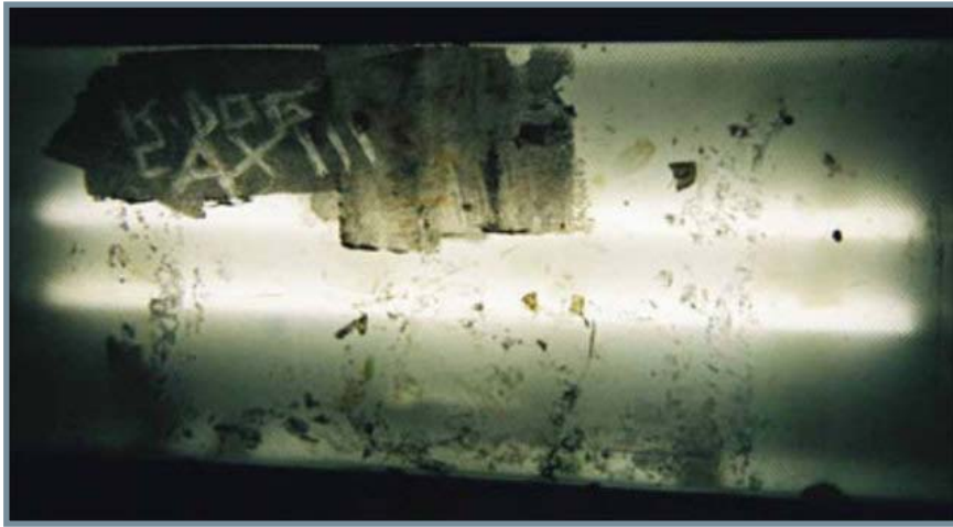
A photo of the walls from the Coke County Juvenile Justice Center Audit: A Report by the Texas Youth Commission. The report stated, "Human excrement was found floating in the [shower] drain during a September 2007 audit."

The track record of the GEO Group in dealing with vulnerable populations, especially children, is of particular concern since GEO has been contracted as the Obama Administration ramps up family detention. The tragic history of GEO's Coke County Juvenile Justice Center (CCJJC) does not bode well for GEO locking up refugee children and their mothers in Karnes City, Texas.