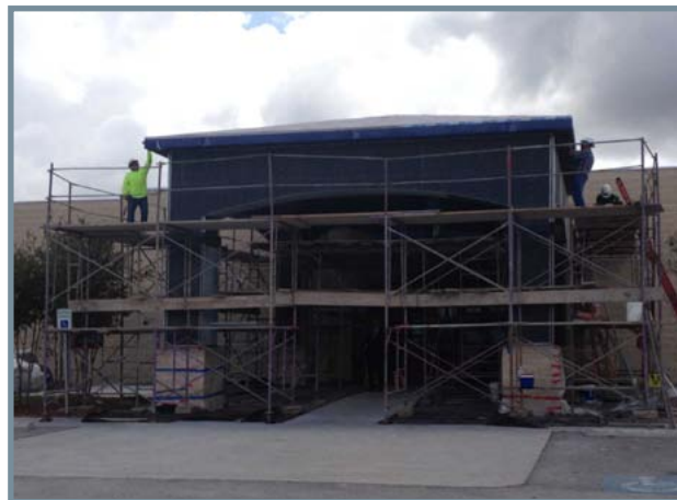
Construction on the facade of the Karnes County Family Detention Center in September 2014. The facility is currently under construction and rumored to be preparing to double its current capacity.

DHS should prioritize alternatives to detaining immigrant families, particularly those that provide community support for immigrant families. Research shows that alternatives to detention programs – when coupled by legal and social support programs – can be effective in insuring that immigrants appear at their immigration hearings and can be operated at a fraction of the cost of custodial detention.