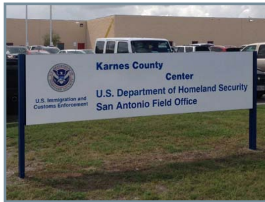
Evidence surrounds the Karnes County Family Detention Center of how sudden the resurgence of family detention has been. The sign outside the facility had still not been updated as of September 17 to reflect the change in population there, from adult men to women and children.