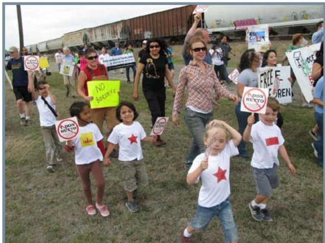
Children protest the detention of families at T. Don Hutto during the first 100 days of Barack Obama's presidency. There were 100 different actions against the practice during those first 100 days. The days of family detention at Hutto remain ingrained in the memories of the people who have advocated against it from the beginning.

After the terrorism disaster of 9/11, the U.S. government acted to tighten border security, many features of which amounted to nothing more than a massive crackdown on ordinary people crossing our Southern border to seek a better life for themselves and their families. In 2002, Congress created the Department of Homeland Security (DHS), replacing the former Immigration and Naturalization Service with Immigration and Customs Enforcement (ICE), and pulling in a number of other federal agencies (e.g., the Coastguard; the Secret Service) previously located in other federal departments.