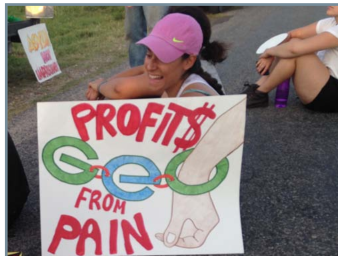
A rally against family detention outside the T. Don Hutto Detention Center in Taylor, Texas on August 9, 2014. The rally marked the five year anniversary of the end of family detention at Hutto.