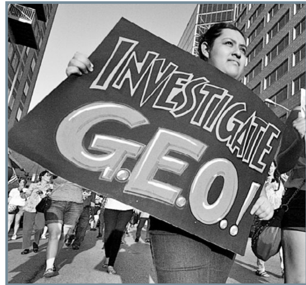
The abuse and retaliation found in GEO's facilities for adults were familiar to the children in the Mississippi Walnut Grove juvenile detention center. Children who tried to file complaints or report conditions at Walnut Grove were subjected to solitary confinement and other harsh forms of retaliation, including beatings.

The Court ultimately ordered that children be transferred out of Walnut Grove, to a publicly-run juvenile detention center in Mississippi. GEO's contract for Walnut Grove was cancelled and the state re-contracted with another private prison corporation.