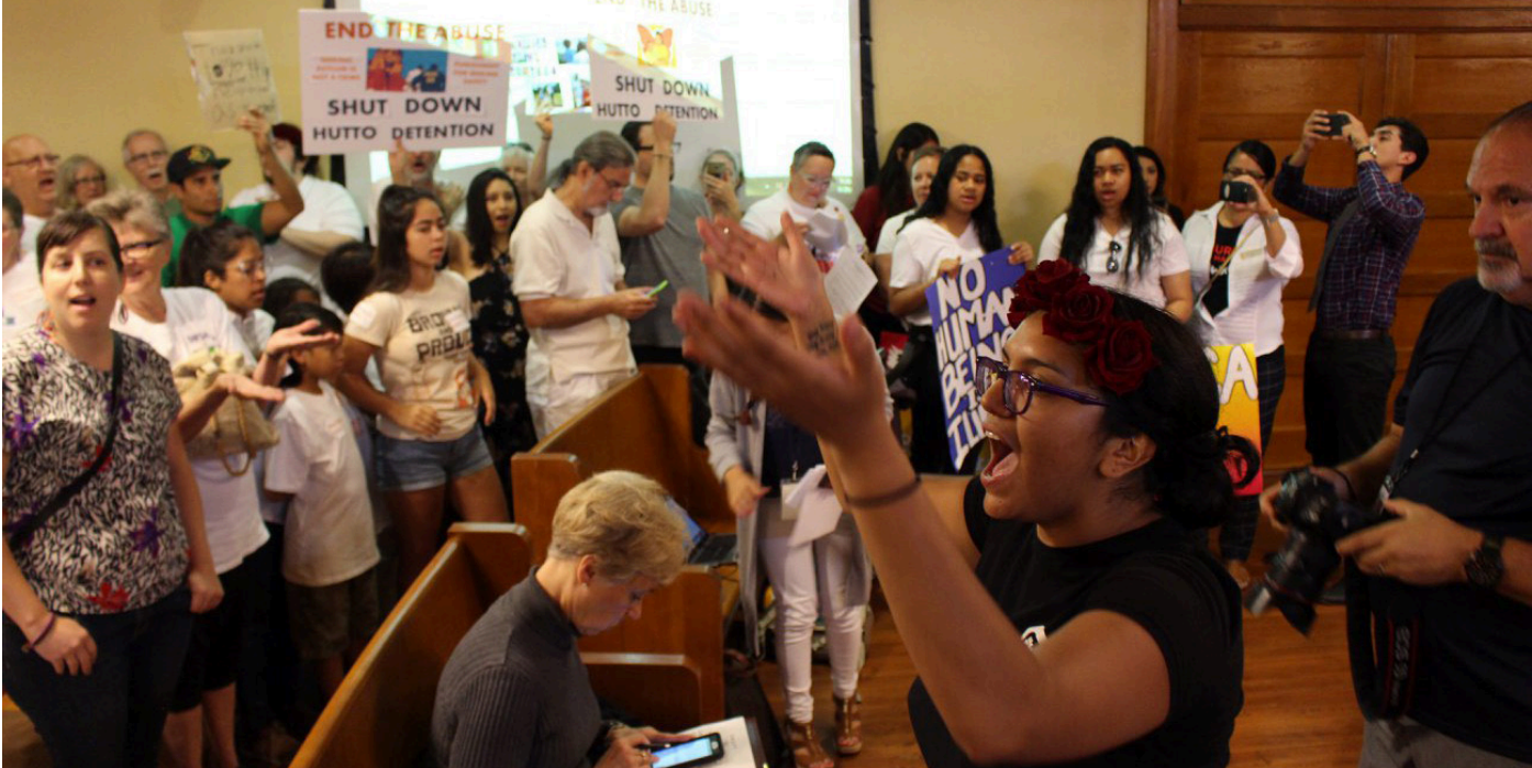
Community members sing inside a packed county courthouse before the Commissioner's Court vote to end the county's contract for Hutto.

question the Hutto contract, a party with a stake in the case—such as a bidder that was not chosen—would have to bring suit for the process to be scrutinized in court. Detained women and immigration advocates likely have no such ability and so the suspect handling of the contract will probably never be scrutinized by a court.