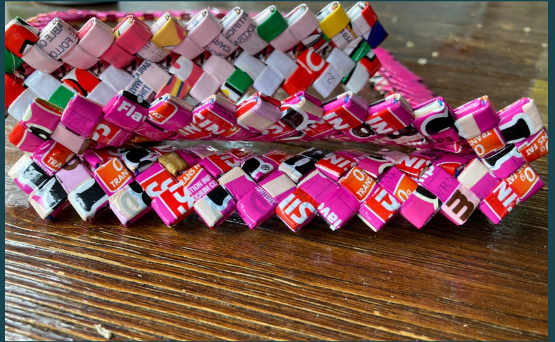
Handicrafts made of packaging from ramen soups purchased in the commissary.

(not her real name) Guatemalan 36 Years Old