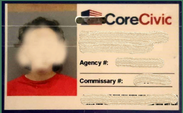
CoreCivic identification card issued to women detained at Hutto.

“It is so unfair that they treat us immigrants without respect or mercy. Being at Hutto was traumatic, because the guards did what they wanted with us. They decided when I would eat, when I could bathe, when I would go to sleep, and when I could go outdoors to take a walk. Every time that the guards took me and the other women from one part of the facility to another, they yelled at us and told us that we must form a single line along the wall. They threatened us, saying that if we touched one another or failed to follow their orders, they would put a black mark on our records and that the judge would punish us with more time in the jail. It is so unfair that we have no rights. We could not stand up to the guards, because they threatened us with punishment. They said that they would put us in solitary confinement where we would not be able to communicate with anybody, much less use the phone. We would be in a small room in the cold for four days. The guards also yelled at us at all different times of day to present our IDs. Sometimes they woke us up at midnight demanding to see our IDs. If we did not get up right away, they yelled at us and beat loudly on metal doors.