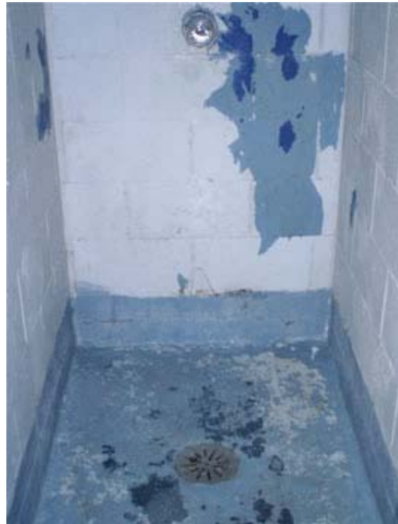
Neglected security shower at the GEO Group's Coke County Juvenile Justice Center. Human excrement was found floating in the drain during an audit in September 2007.